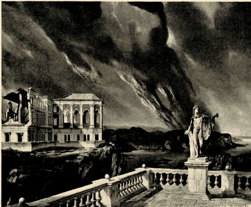
Drie schilderijen v. A. C. Willink uit de jaren 1933—1939. De terechtstelling - 1933 - Zelfportret met schedel - 1936 - Château en Espag- ne - 1939